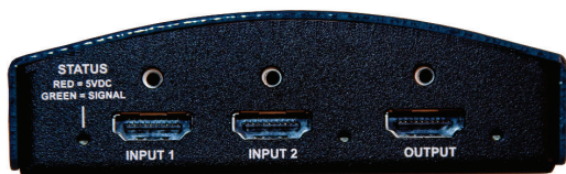
PS105 Front View

The PS105 is an AV-integrated IoT device. When connected to an internet-connected LAN, the PS105 uses advanced encryption technology to connect to Cloud Control, a PS-engineered Amazon AWS MQTT service for external management, control, and performance measurement. Cloud Control is an essential tool for help desk administrators for 1 to 10,000 local or distributed campus-wide management of multimedia rooms.